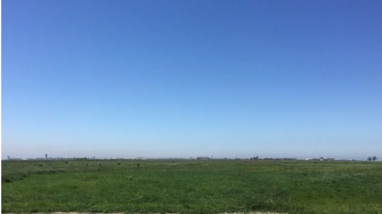
Open land adjacent to Brown Field.

If there is a location that is temporarily expendable (with temporarily relocatable stakeholders) during a city emergency, this is it.